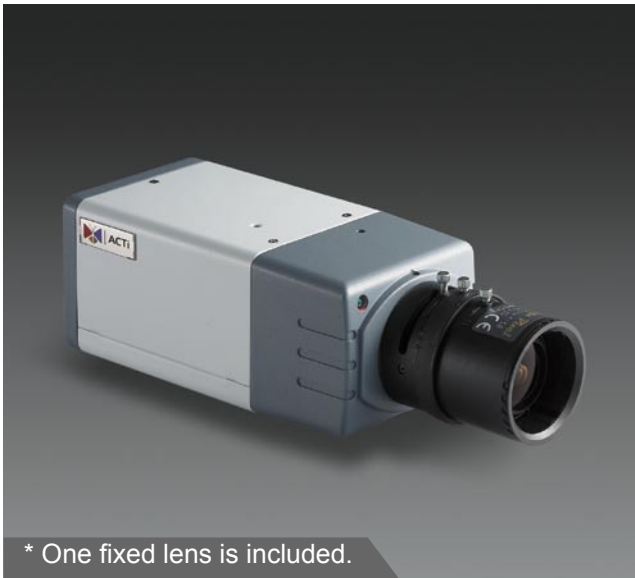
* One fixed lens is included.